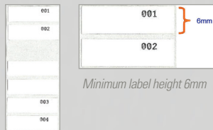
Minimum label height 6mm

* Intelligent leap-over™ : Detects empty label and automatically leaps to the next label